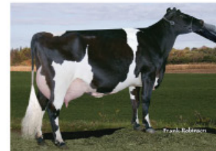
Swedish Red(Sperringe) X Holstein Daughters